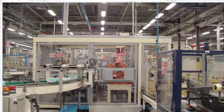
Reparto Pannolini e Salviettine