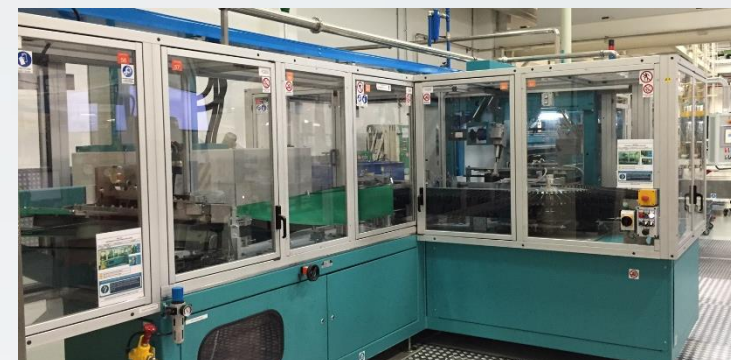
Reparto Ausili per incontinenza